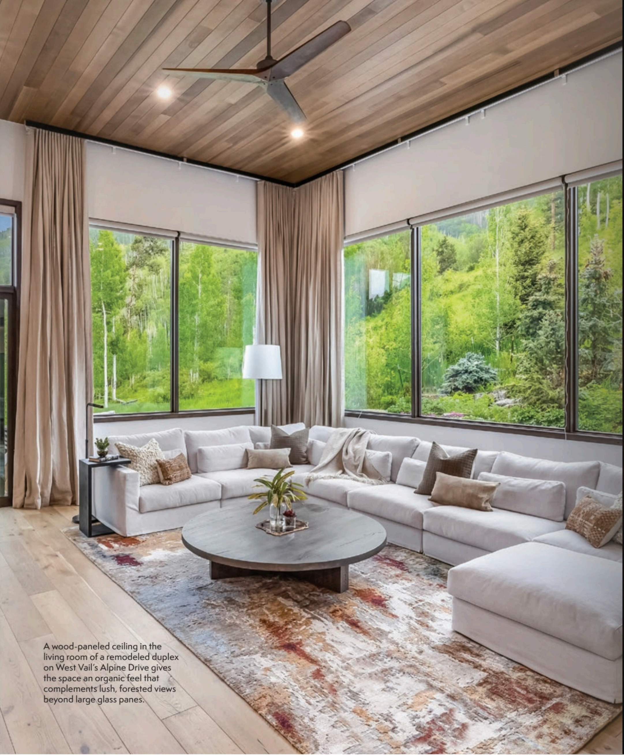
A wood-paneled ceiling in the living room of a remodeled duplex on West Vail's Alpine Drive gives the space an organic feel that complements lush, forested views beyond large glass panes.