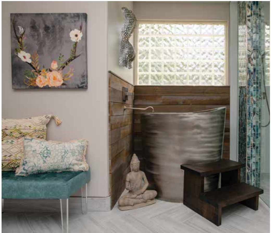
The Japanese soaking tub is a piece of art in and of itself.